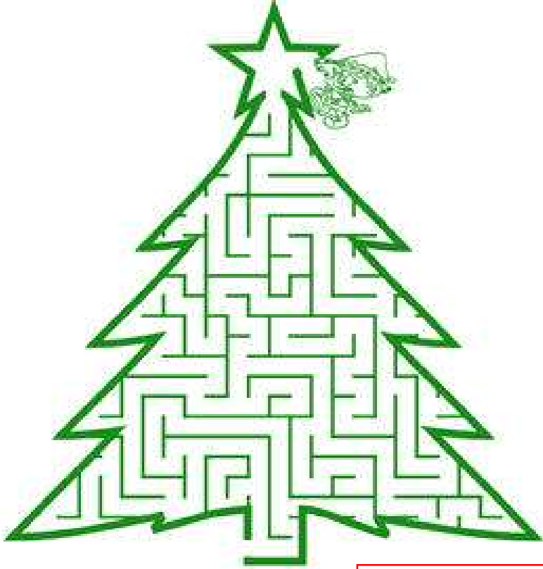
Christmas Tree Maze