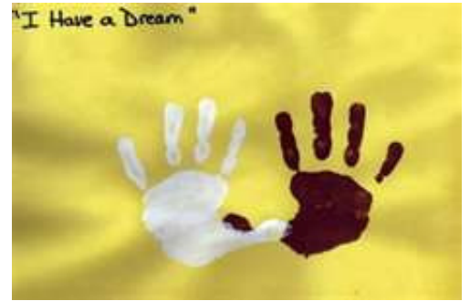
"I Have a Dream"